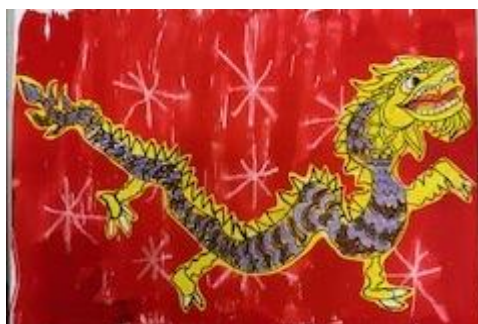
Alex Pre Primary